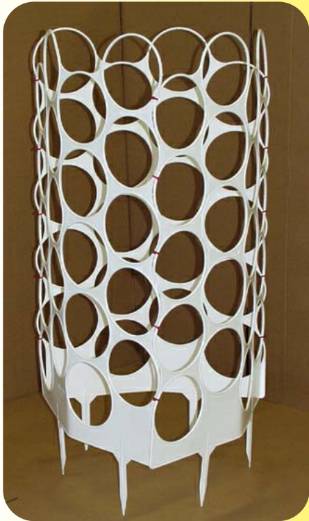
Angled Side View #1 Item# TT-41 Retail Price: $6.49 Each Wholesale Price: $2.25 Each Terms: 30 Days Pkg: 50/Case 500/Skid Case Dims: 47x23x14