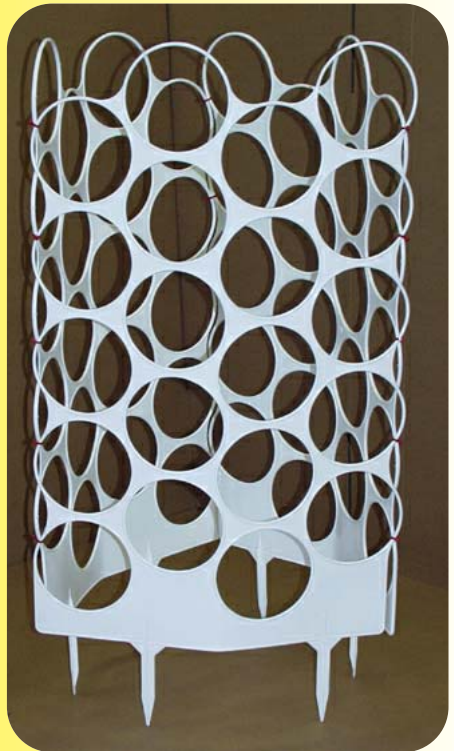
Angled Straight On View #1 Item# TT-41 Retail Price: $6.49 Each Wholesale Price: $2.25 Each Terms: 30 Days Pkg: 50/Case 500/Skid Case Dims: 47x23x14