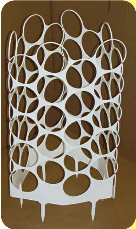
Angled Side View #1 Item# TT-41 Retail Price: $6.49 Each Wholesale Price: $2.25 Each Terms: 30 Days Pkg: 50/Case 500/Skid Case Dims: 47x23x14