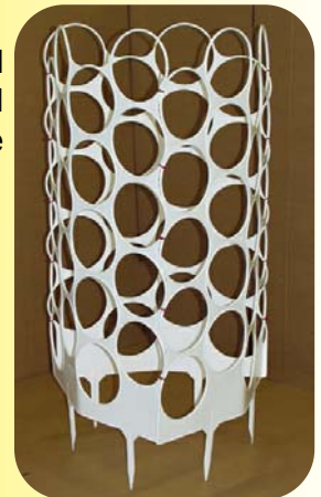
Actual Assembled Cage

Three sides connect together to create a tomato cage that will help control the growth of your tomato plants. The Plastic Tomato Cage can also be used in a straight line for pea fences. Just fasten together with strips of cloth, rope, zip ties wire etc. and you will have a durable fence for your gardening needs.