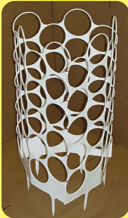
Angled Side View #2 Item# TT-41 Retail Price: $6.49 Each Wholesale Price: $2.25 Each Terms: 30 Days Pkg: 50/Case 500/Skid Case Dims: 47x23x14